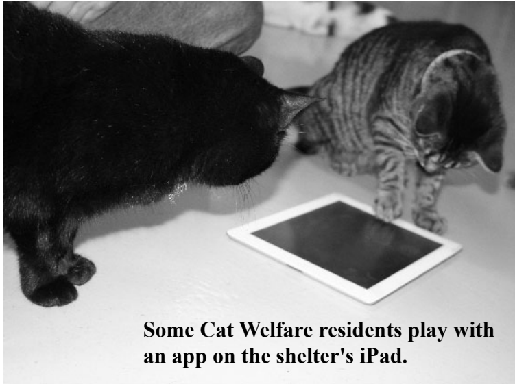
Some Cat Welfare residents play with an app on the shelter's iPad.