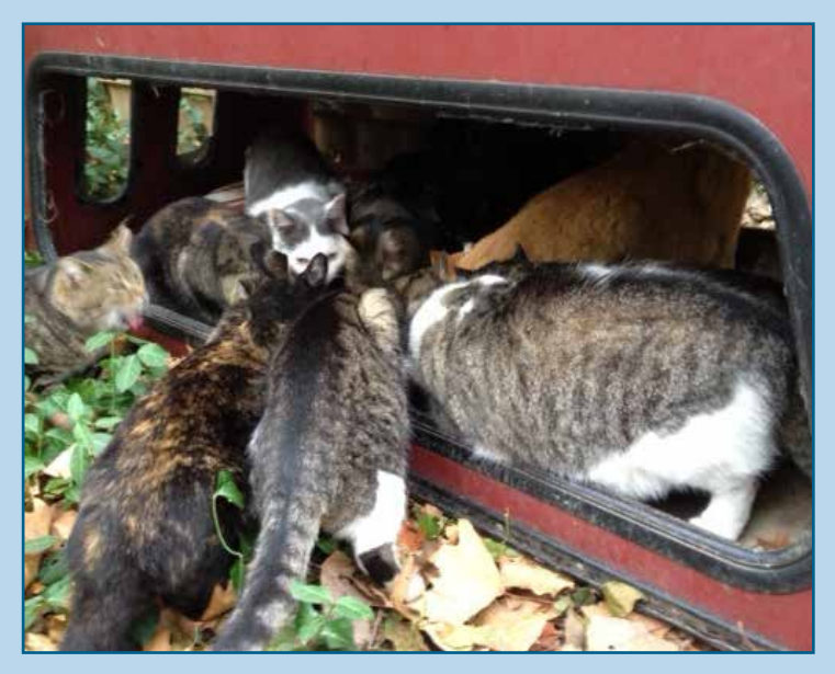
ier. One of the best online resources is Alley Cat Allies, alleycat.org. And, of course, our staff is always here to answer your questions – we're just one phone call away!

On average, our front office staff can expect 20 messages when they arrive in the morning, and generally the phones are busy all day with calls from compassionate individuals trying to find homes for stray cats and kittens. These calls tend to increase in the winter months as caring people are worried about the welfare of homeless felines. It's heartbreaking to turn away any homeless cat or kitten, but lack of space sometimes prohibits us from accepting them into the shelter. To help you care for those kitties that must live outdoors until we have available accommodations, there are some positive steps you can take to keep them safer, warmer and health-